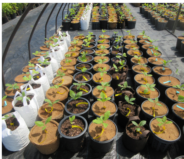
Picture 6: There are many containers available on the market. Root management best practices should be used regardless of which container is selected.

Trees and shrubs should be planted in containers that minimize root defects and encourage branching of the root system inside of the root ball. Certain species perform better in specific containers, so fine-tuning the container selection based on production needs is important. Examples include air-pruning plastic containers, fabric containers which also air-prune to a degree, biodegradable/natural materials and containers that use light to manage root systems.