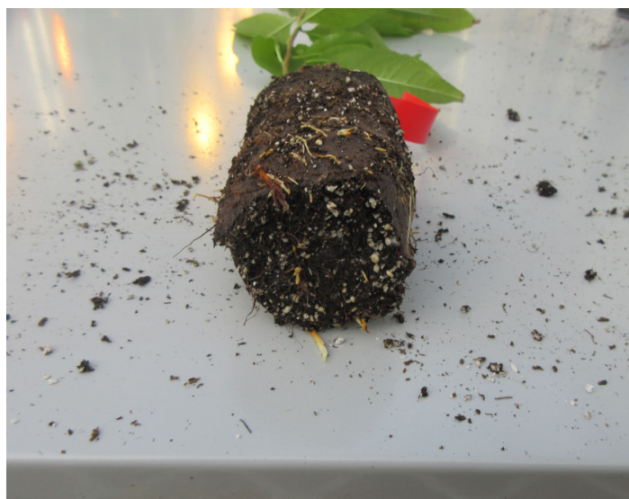
Picture 8: Monitor the root tips exiting the plug to help determine when it is time to shift to larger containers or move plugs to the field.

Late summer transplanting can be successful if seedlings have reached a desirable size and can promote late season root and shoot growth in the field after transplanting.