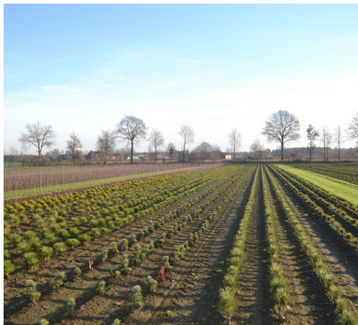
Picture 7: The proper timing of lining out plugs will help ensure a successful transition.

transplanting which helps promote a rapid development the following growing season.