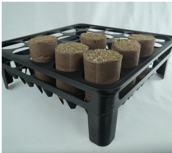
Picture 4: The legs on the RootSmart tray raise it off the ground to allow for air flow underneath the bottom of the plugs.

features a lid that snaps on and should not be removed during production as it holds the plugs loosely in place while keeping the tray rigid.